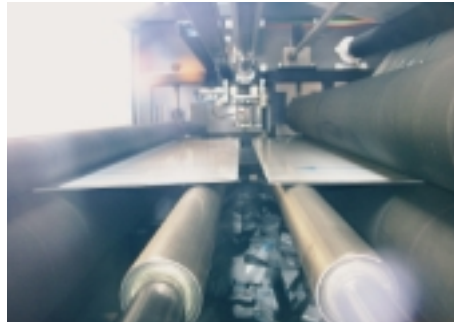
foil cutting between the sheets +/- 0,00 mm