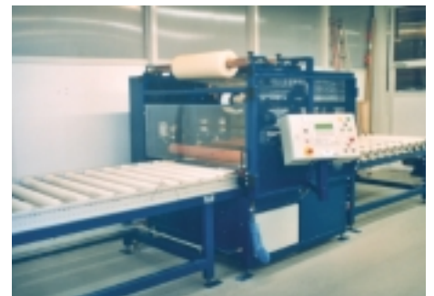
foil trimming integrated