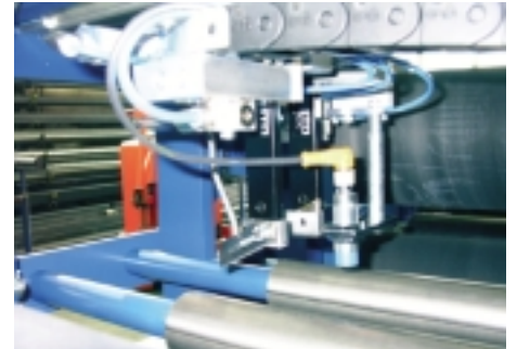
foil cutting with knife