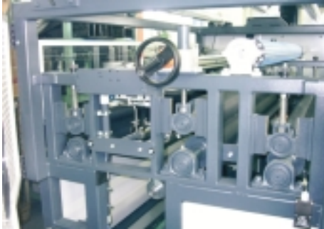
foil laminator, standard