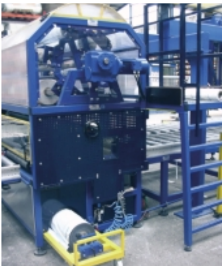
easy change of foil rolls